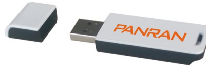
▲ Wireless Communication Module