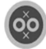
Japanese Standard CHAdeMO