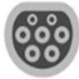
European Standard Mennekes (Type2)