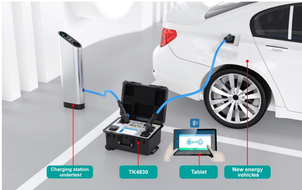
Test Method 1: Test with new energy vehicles as load