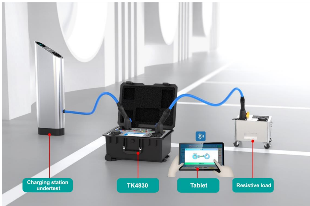
Test Method 2: Test with programmable resistive load as load